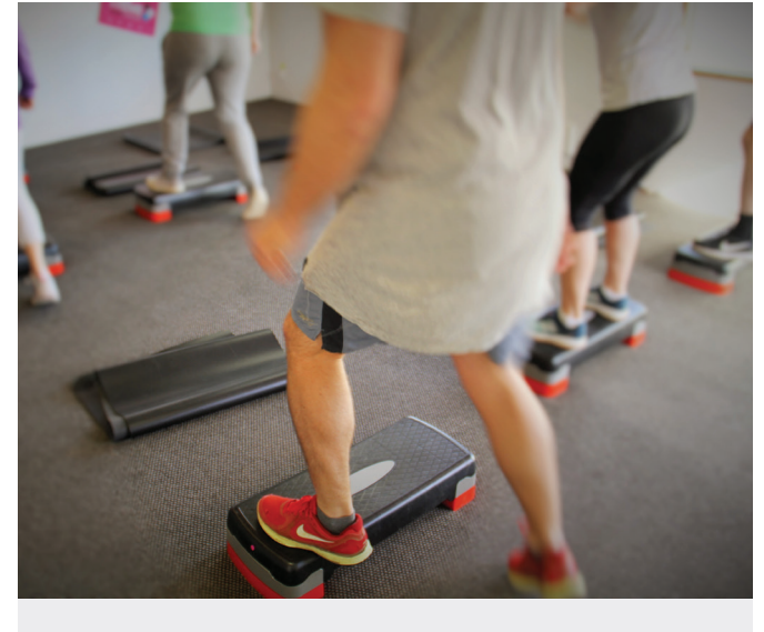
TO ENROLL GO TO: WWW.PINCANDSTEEL.UK/PROGRAMS/NEXT-STEPS